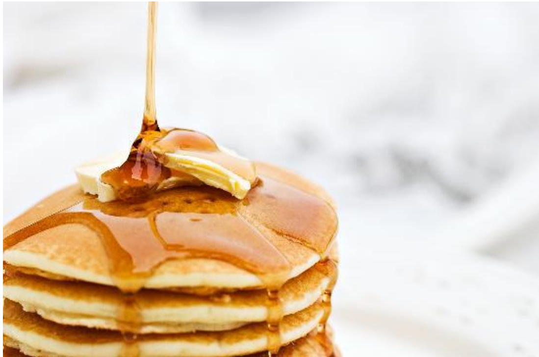
Stack of pancakes with butter and syrup. Or: Pancakes.