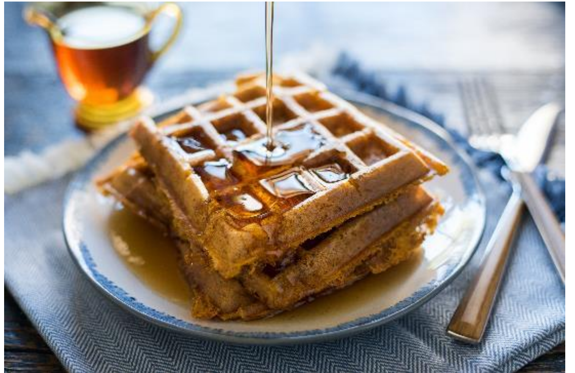
Waffles topped with honey.