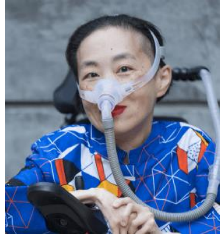
Photo of an Asian American woman in a power chair. She is wearing a blue shirt with a geometric pattern with orange, black, white, and yellow lines and cubes. She is wearing a mask over her nose attached to a gray tube and bright red lip color. She is smiling at the camera.