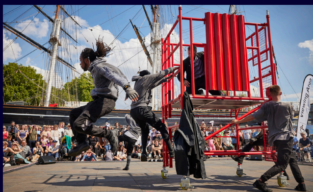
SCRUM, Avant Garde Dance at GDIF 2022