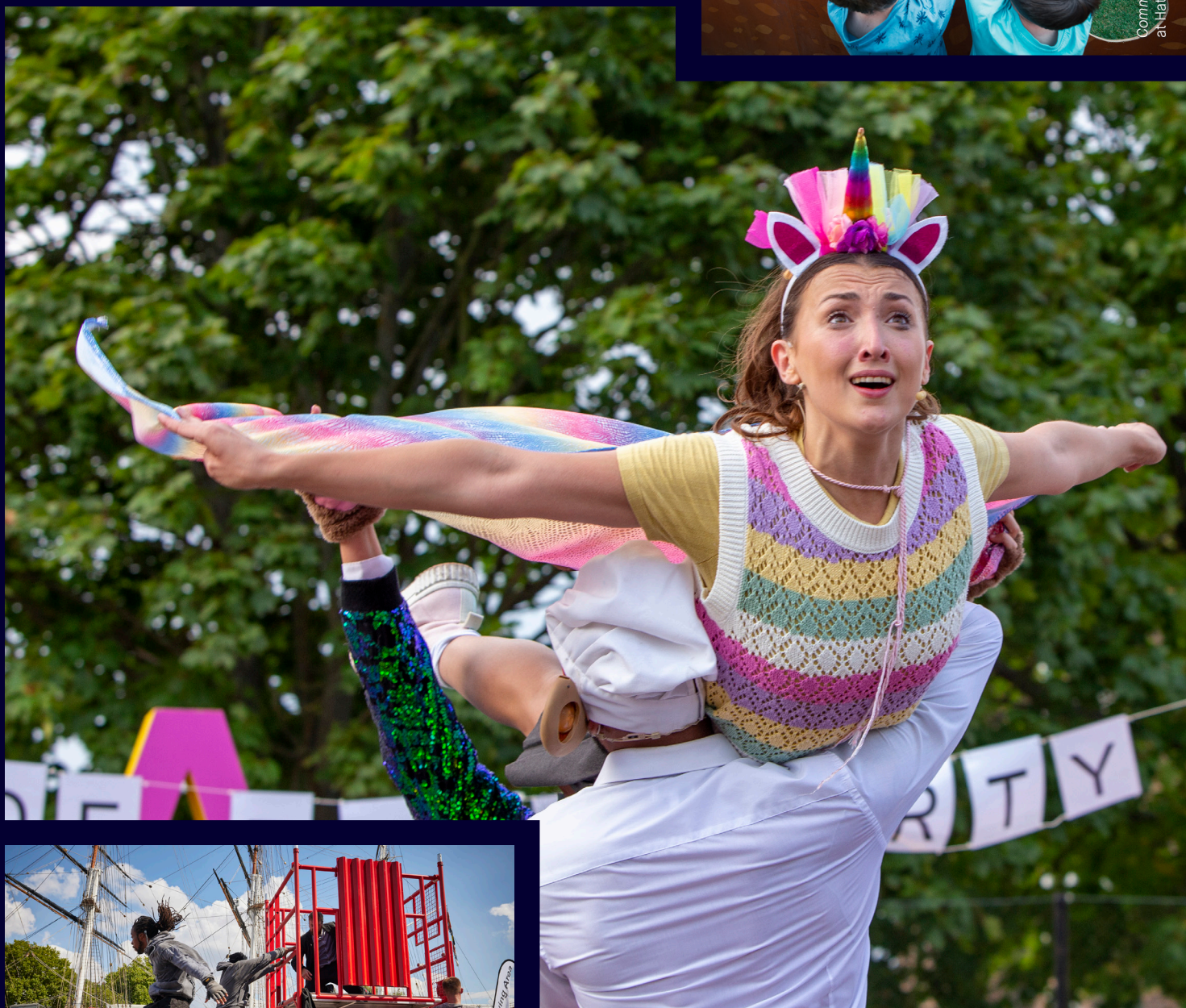
There Should Be Unicorns, Middle Child at GDIF 2022